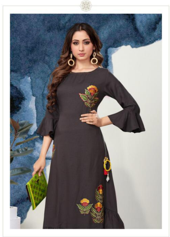
Classic elegance is the balance between proportion, emotion and surprise we make clothes women make fashion