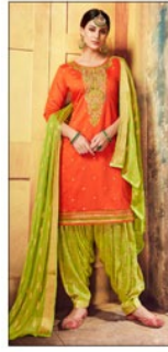
D.NO :- 4287