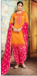
D.NO :- 4285