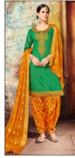
D.NO :- 4288