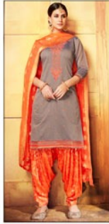
D.NO :- 4286