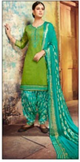
D.NO :- 4281