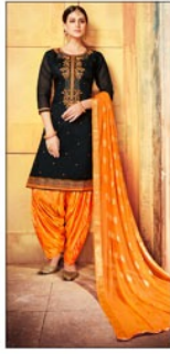
D.NO :- 4283