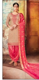
D.NO :- 4291