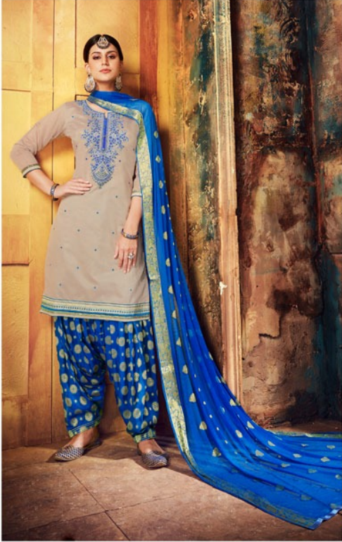
D.NO :- 4292