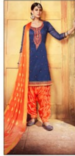
D.NO :- 4290