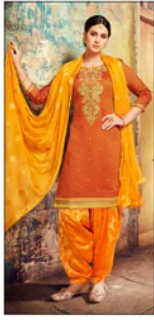
D.NO :- 4282