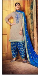
D.NO :- 4292