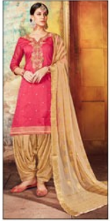
D.NO :- 4284