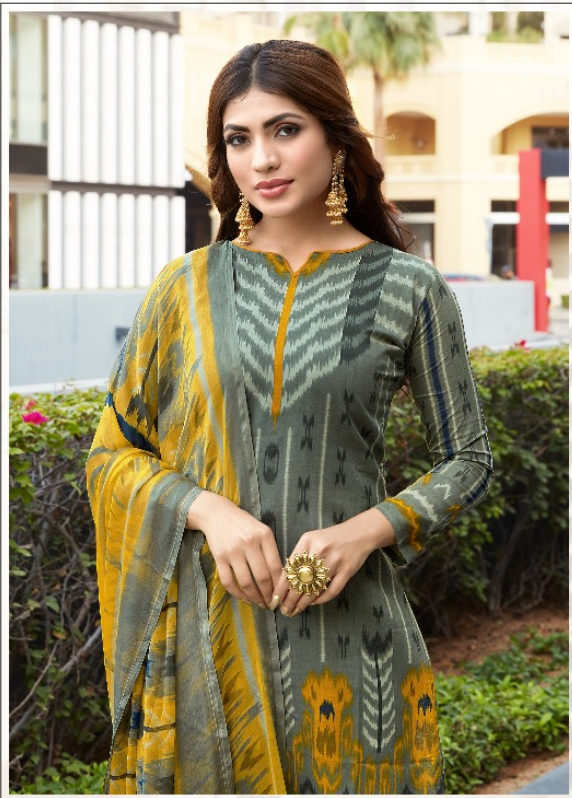
Now is the time to be a little more adventures in design and colours of your. experience the exotic floral bliss in soft, chocolate and design work which gives a sweetly feminine touch to your personality