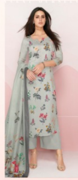
DESIGN : 025