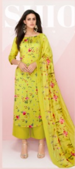
DESIGN : 023