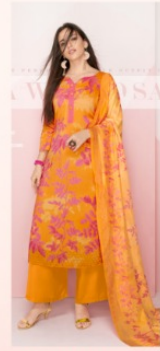
DESIGN : 026