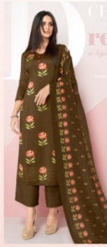
DESIGN : 024