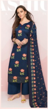
DESIGN : 018