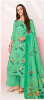
DESIGN : 020