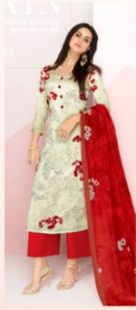
DESIGN : 019