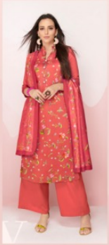
DESIGN : 021