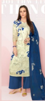
DESIGN : 022