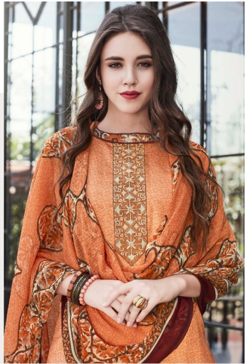
CLASSY LOOK Color is an important choice this year, and fused with exquisite work, it becomes like organically elegant.