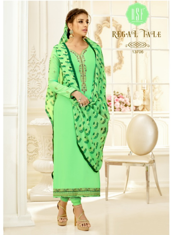
When you love fashion, there is no weekend. Everything just blends together. Fashion is about how you place the object on the person.