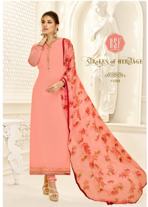
I appreciate simplicity, true beauty that lasts over time, and a little with and eclecticism that make life more fun.