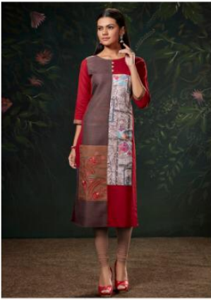
CODE # S - 3005