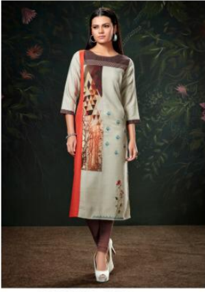
CODE # S - 3001