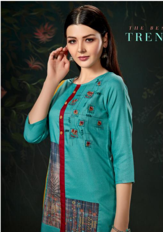
Beauty is not having the good skin or good face. It about having the purest heart.