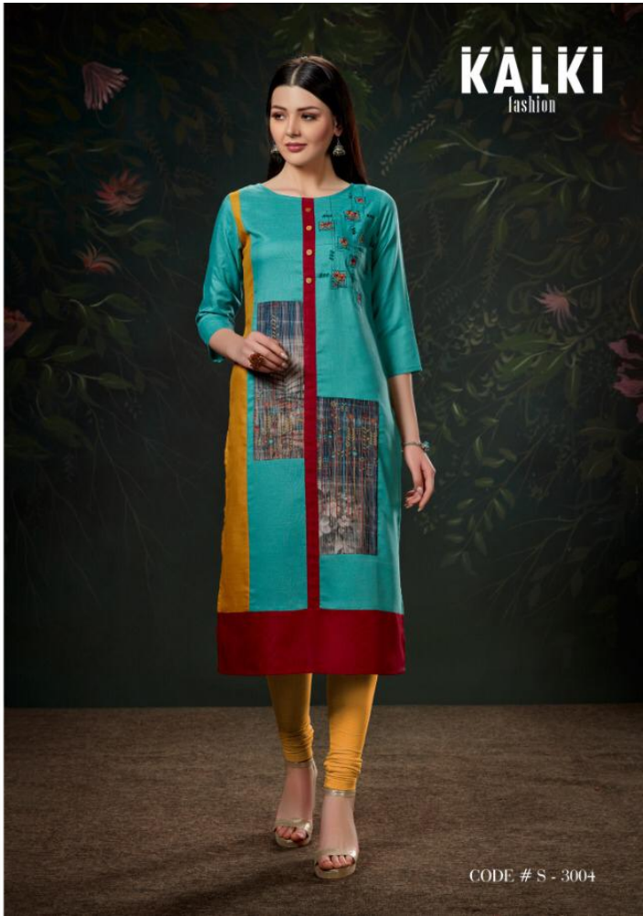
CODE # S - 3004