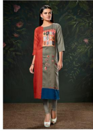
CODE # S - 3003