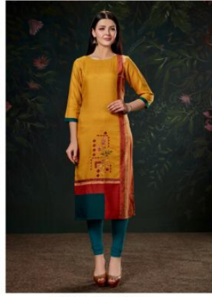
CODE # S - 3002