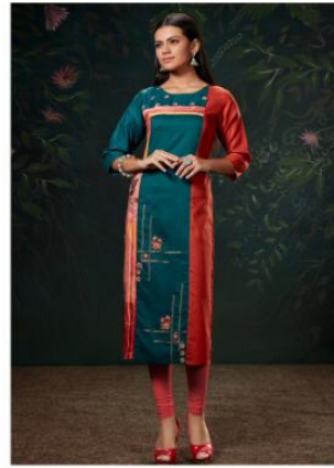
CODE # S - 3007