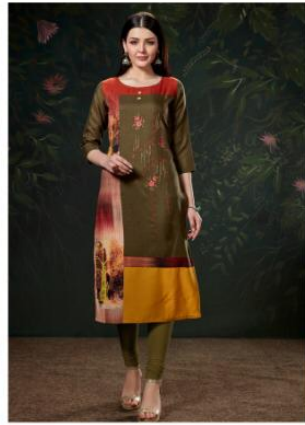
CODE # S - 3006