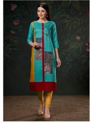
CODE # S - 3004