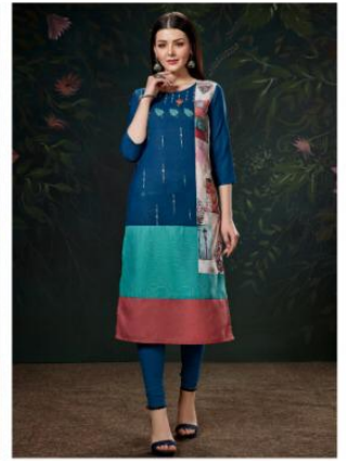
CODE # S - 3008