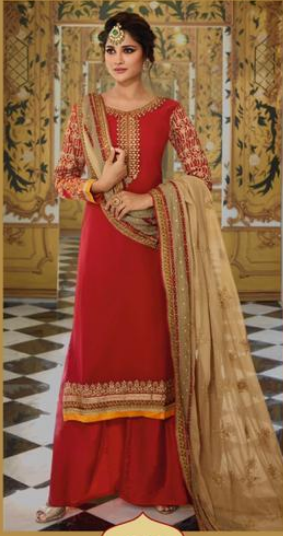
• 15901 •