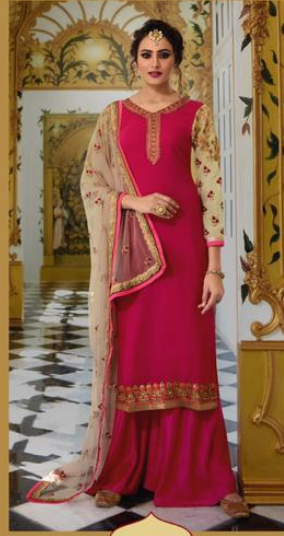
• 15903 •