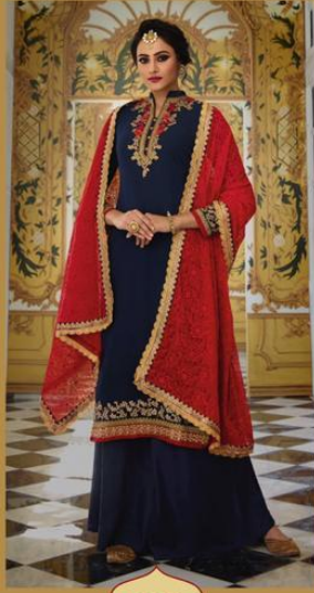
• 15902 •