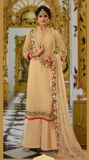
• 15904 •