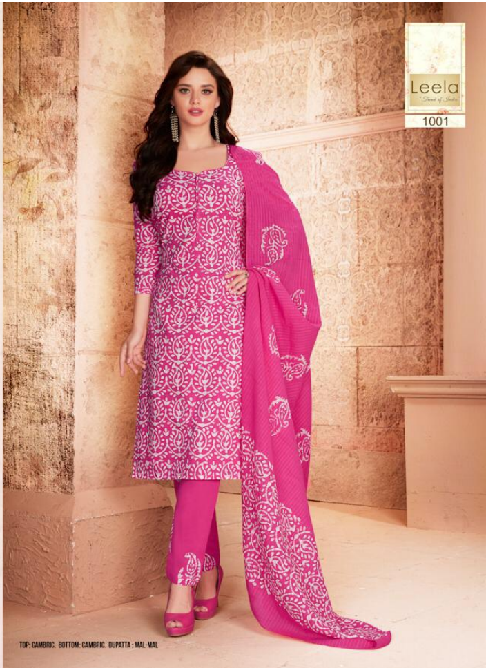
TOP: CAMBRIC. BOTTOM: CAMBRIC. DUPATTA: MAL-MAL