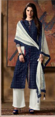
◆ D.No.2192 ◆