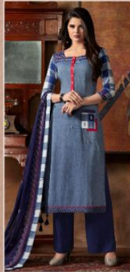
◆ D.No.2195 ◆