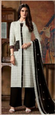
◆ D.No.2194 ◆