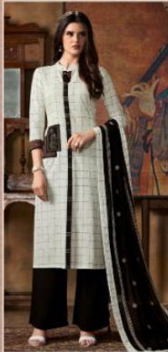
◆ D.No.2194 ◆