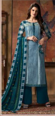
◆ D.No.2193 ◆