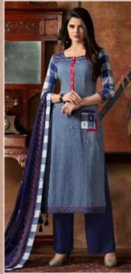
◆ D.No.2195 ◆