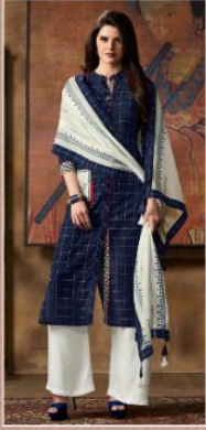
◆ D.No.2192 ◆