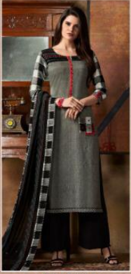
◆ D.No.2191 ◆