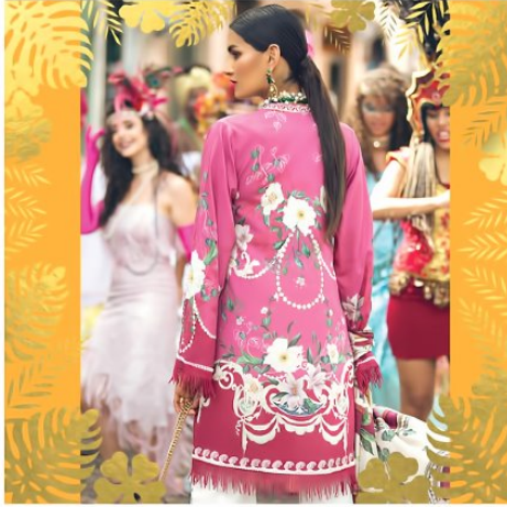
Moving to the rhythm of the drum beats that musicians play.