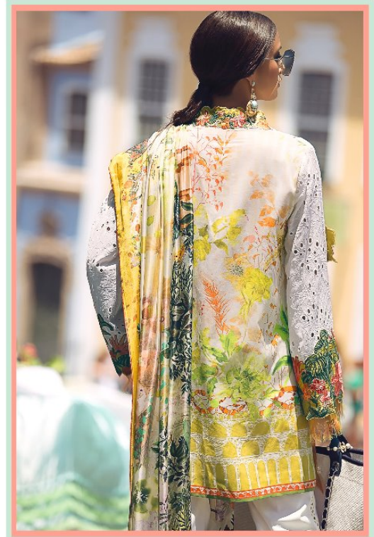
SAADIA ASAD FESTIVAL COLLECTION VOL-02