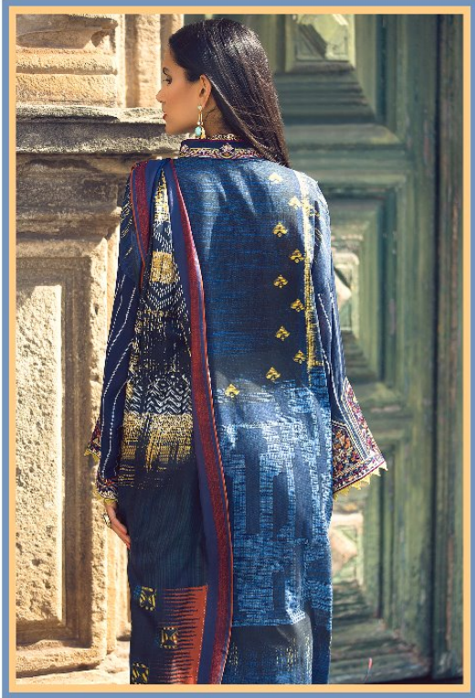
SAADIA ASAD FESTIVAL COLLECTION VOL-02