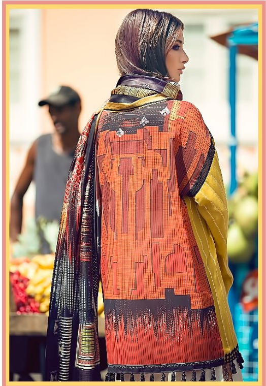
SAADIA ASAD FESTIVAL COLLECTION Vol-02