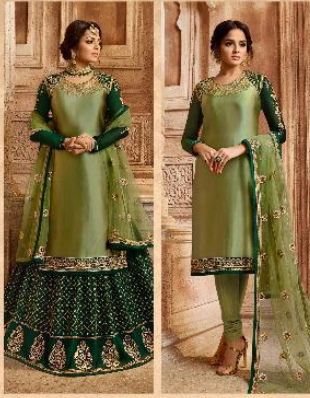
● D.NO.3001 ●