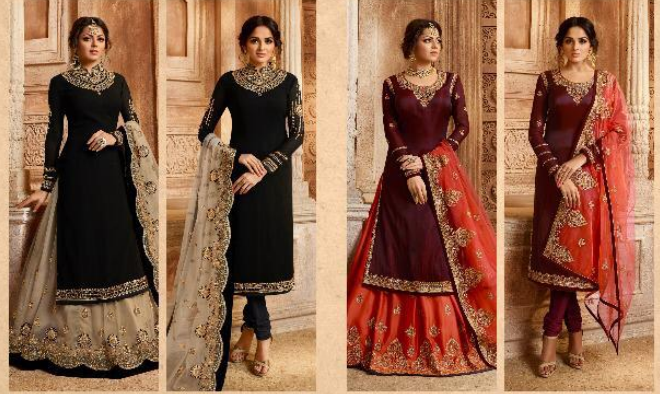
● D.NO.3007 ●