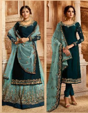
● D.NO.3005 ●