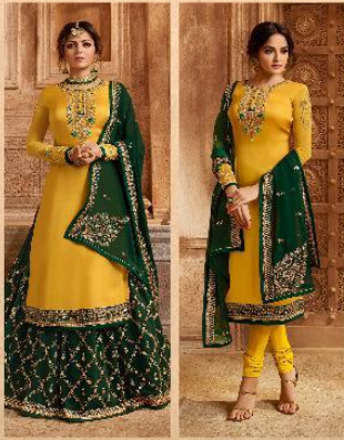
● D.NO.3004 ●