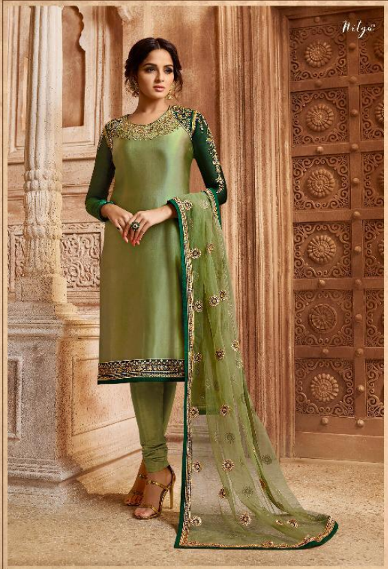
● D.NO.3001 ●