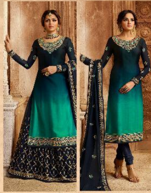
● D.NO.3002 ●