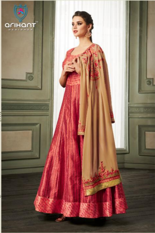
Brilliant hues & lustrous textures give you a new makeover this season.