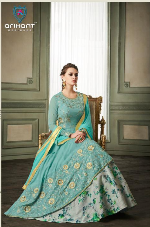
This sparkling beauty of attire will work their magic on everything in your wardrobe.