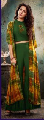
- 9452 -