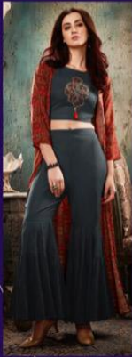
- 9455 -