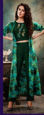
- 9454 -