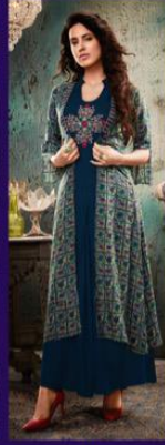
- 9453 -