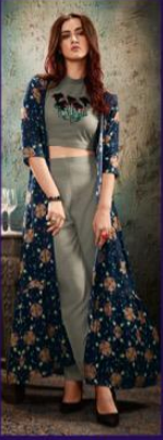
- 9451 -