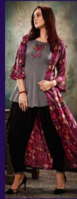
- 9457 -