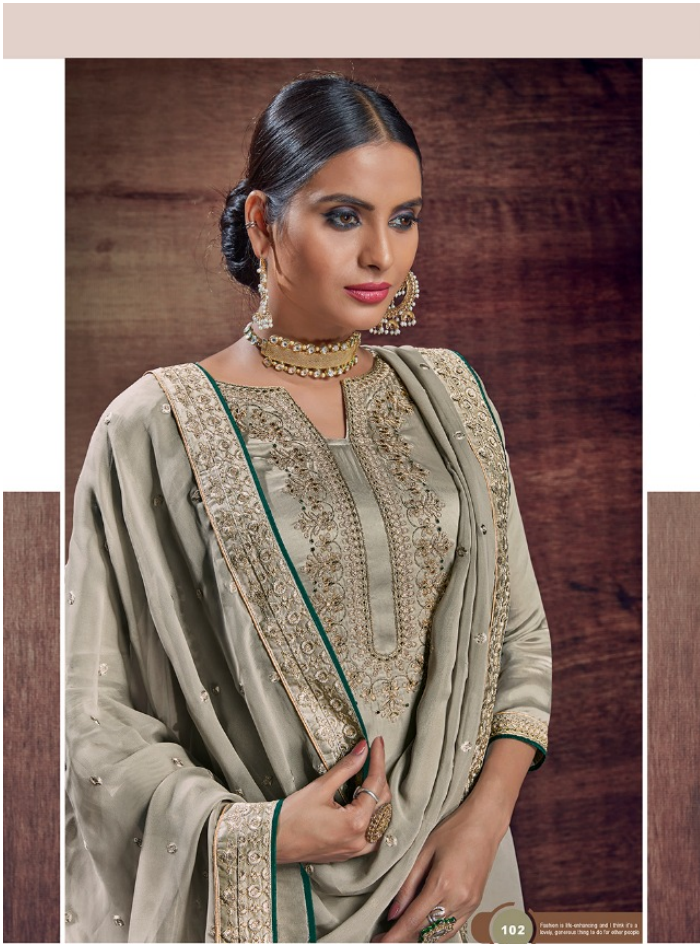
102 Fashion is the art of dressing well | It's not about the clothes, it's about the person.