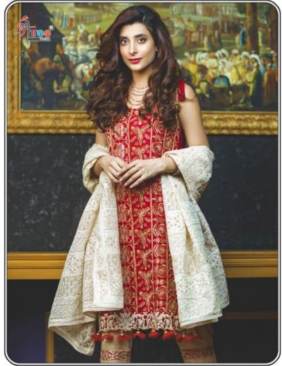
RANG RASIYA Premium Collection