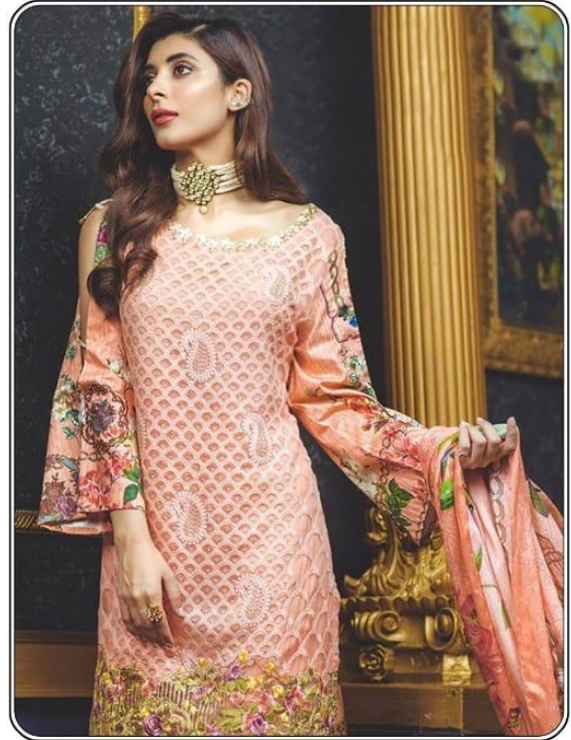
RANG RASIYA Premium Collection