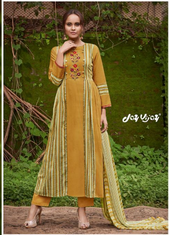
Reclaim a subtle understated elegance as your signature style. GULNAAZ | STYLE: 4223