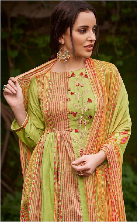
A season dress can last for several months or, if you choose one from this season collection even years! GULNAAZ | STYLE: 4227