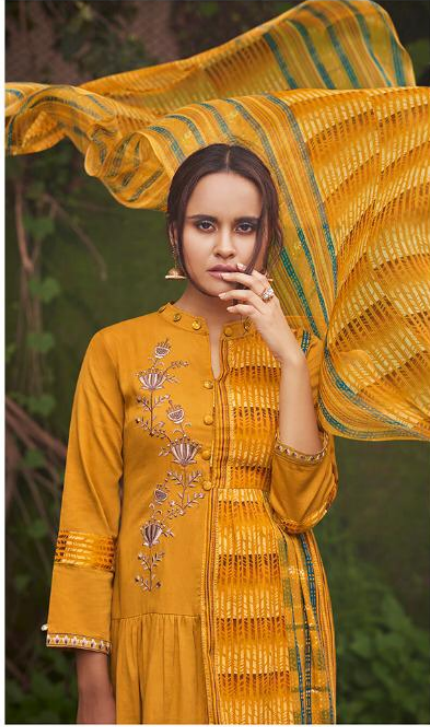
A flow dress with nostalgic detailing takes us back to the pretty girly frocks of our childhood. Statement slides bring it into now.