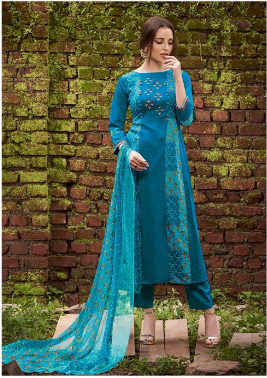
Dictate your style statement with the season's latest trends. GULNAAZ | STYLE: 4221