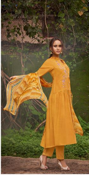
Each piece is grand with subtle hints of unambiguous style.