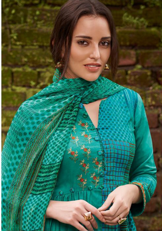
Introduce simplicity in your life and style statement with this lovely garment.