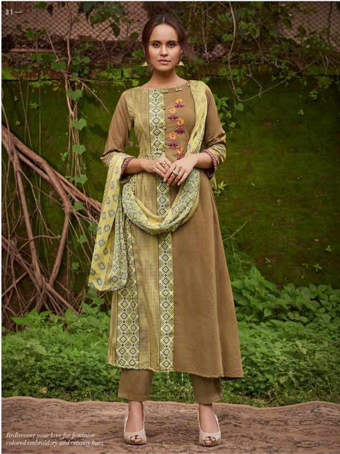
Rediscover your love for feminine colored embroidery and creamy hues.