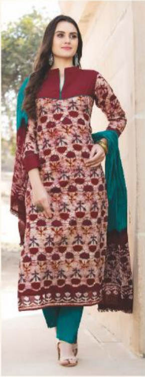
shagun D. No.: 1404