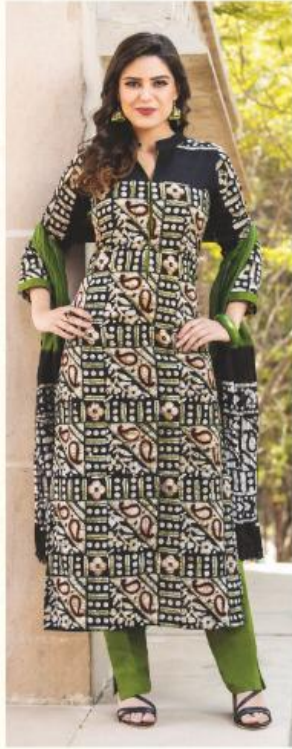
shagun D. No.: 1405