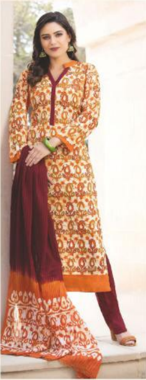
shagun D. No.: 1403