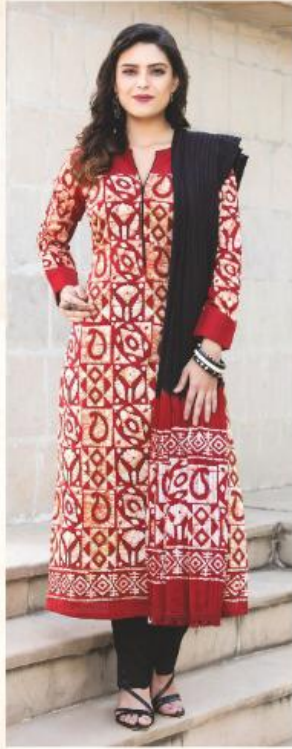
shagun D. No.: 1401

Top: Cotton | Bottom: Cotton | Dupatta: Mal-Mal