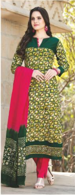
shagun D. No.: 1402