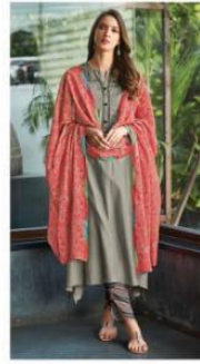
Design No. 456