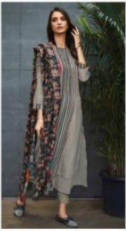
Design No. 445