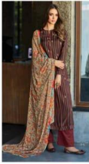
Design No. 430