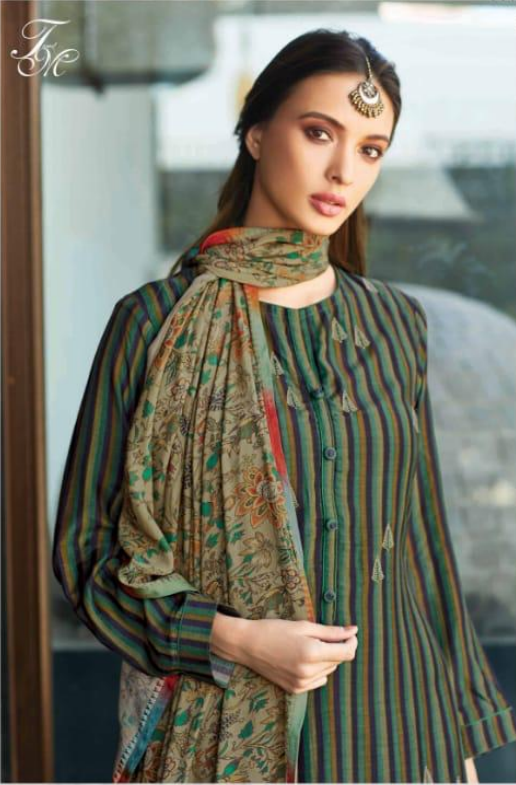
Design No. 422