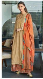
Design No. 492