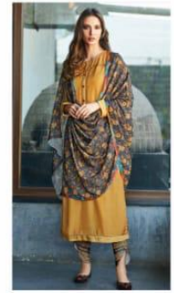
Design No. 458