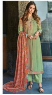
Design No. 438