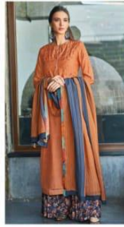
Design No. 439