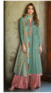
Design No. 486