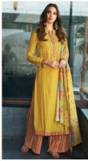
Design No. 465