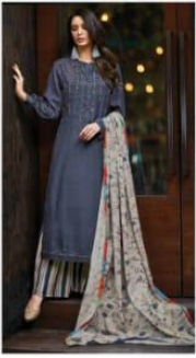
Design No. 410