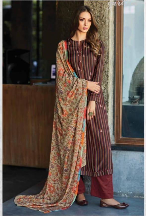
Design No. 430