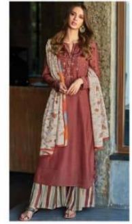
Design No. 418