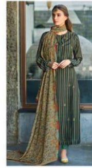
Design No. 422