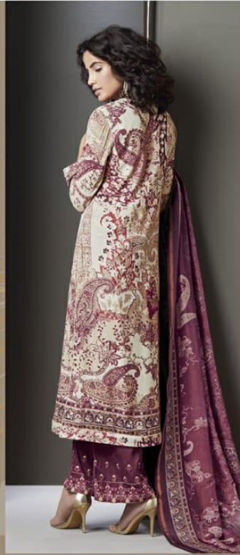
DESIGNE NO | 201