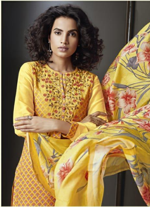
DESIGNE NO | 286