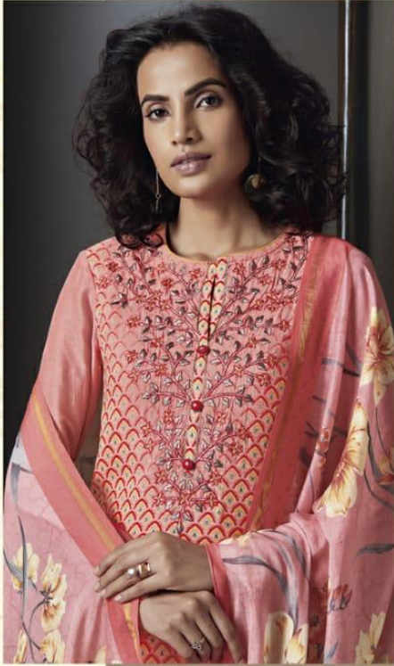
DESIGNE NO | 294