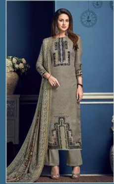
D. No. 29006