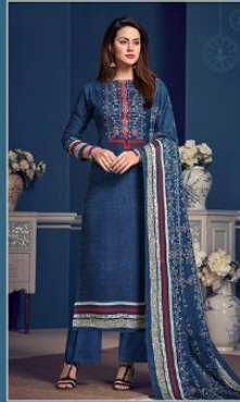
D. No. 29004