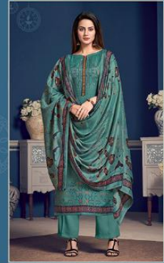
D. No. 29008