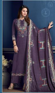
D. No. 29005