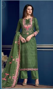
D. No. 29002