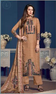
D. No. 29003