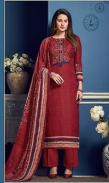
D. No. 29007