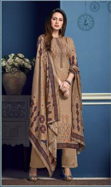
D. No. 29001