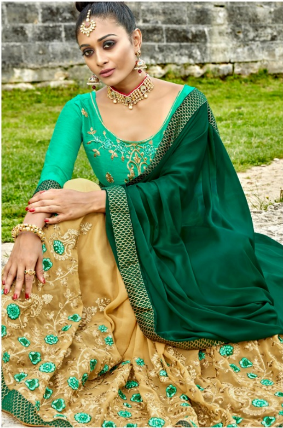
SUCH TRADITIONAL COLLECTION INDEED MAKE EVERY MOMENT ELEGANT AND JOYOUS. IT WILL HELP CREATE ALL NEW SIDE OF YOUR PERSONALITY.