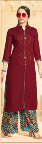
D.NO - 02