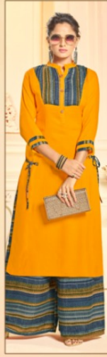
D.NO - 03