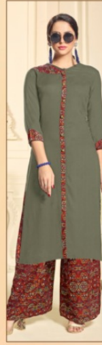
D.NO - 05