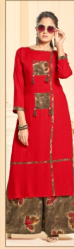
D.NO - 06