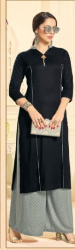
D.NO - 07