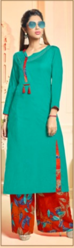
D.NO - 01