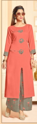
D.NO - 04