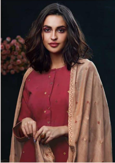
MINAKARI-245 Exclusive Suits