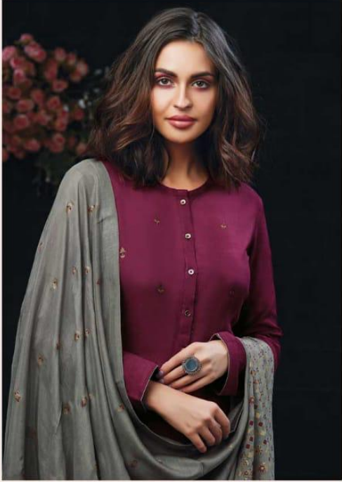
MINAKARI-230 Exclusive Suits