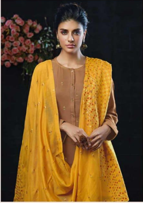
MINAKARI-250 Exclusive Suits