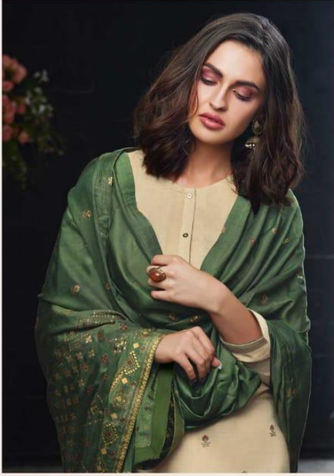
MINAKARI-235 Exclusive Suits