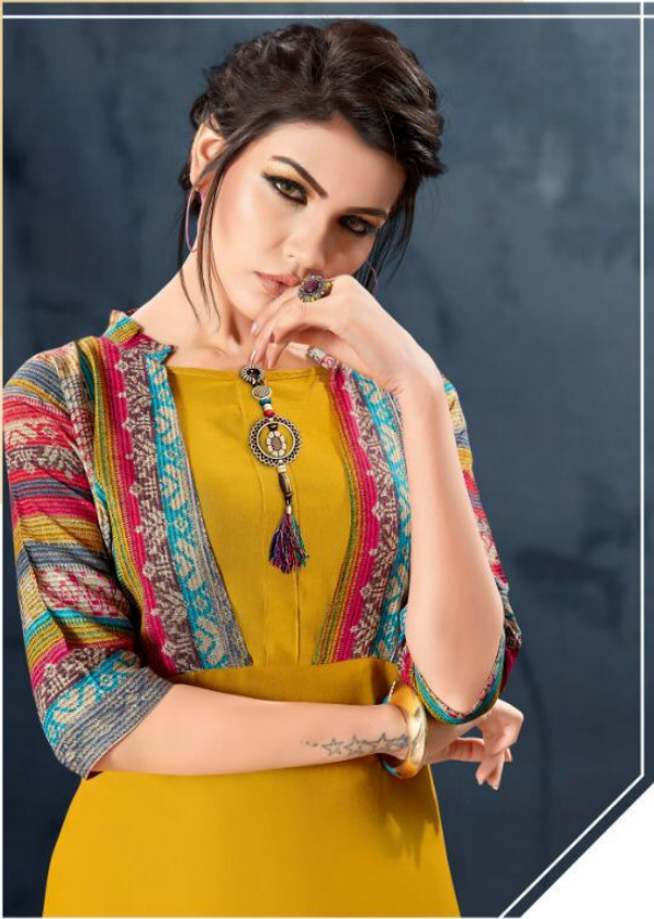
Beauty Is About Beauty is about being comfortable in your own skin. It's about knowing and accepting who you are.