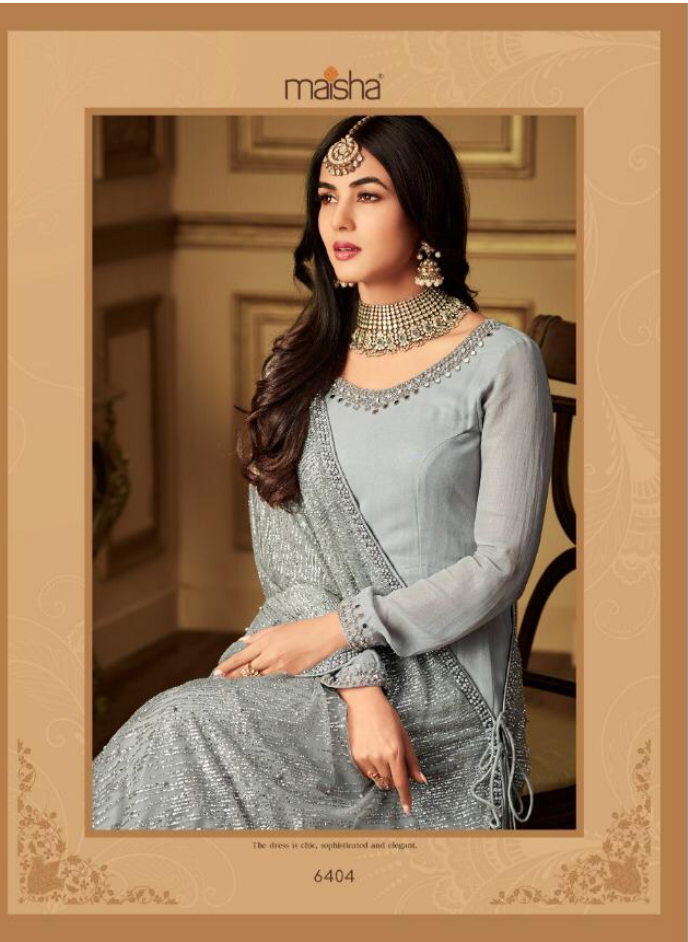
The dress is chic, sophisticated and elegant.