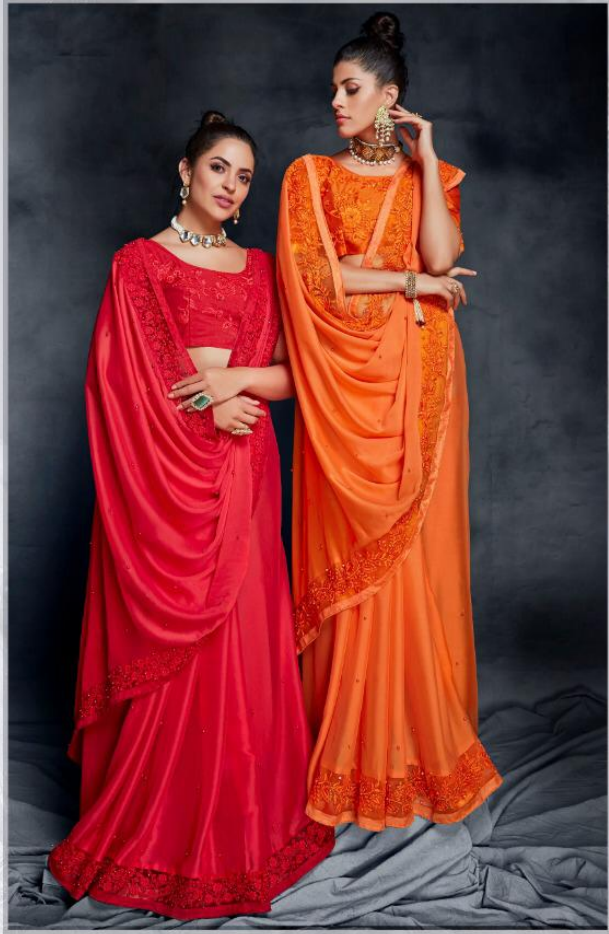
DIFFERENT CULTURES COME TOGETHER IN A TRIBUTE TO FASHION'S BIGGER MOMENT THIS SEASON # 80007#