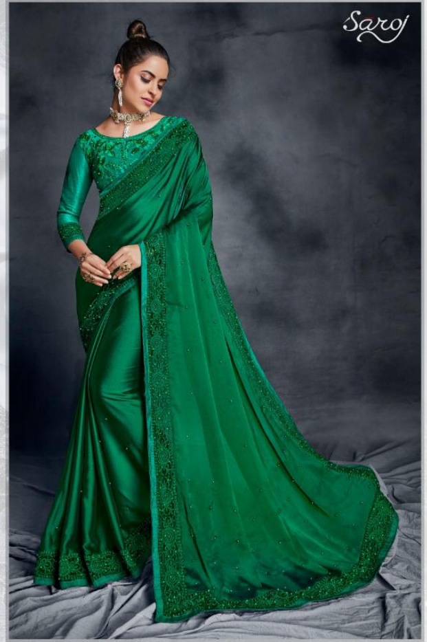
DIFFERENT CULTURES COME TOGETHER IN A TRIBUTE TO FASHION'S BIGGER MOMENT THIS SEASON # 80003#