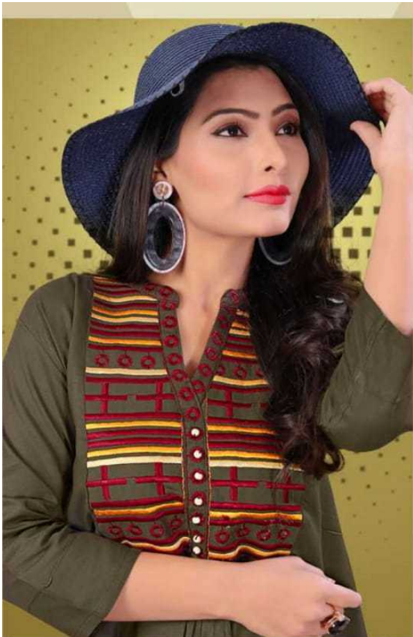
Variation of unique color palette the colors used from are of secondary color family.