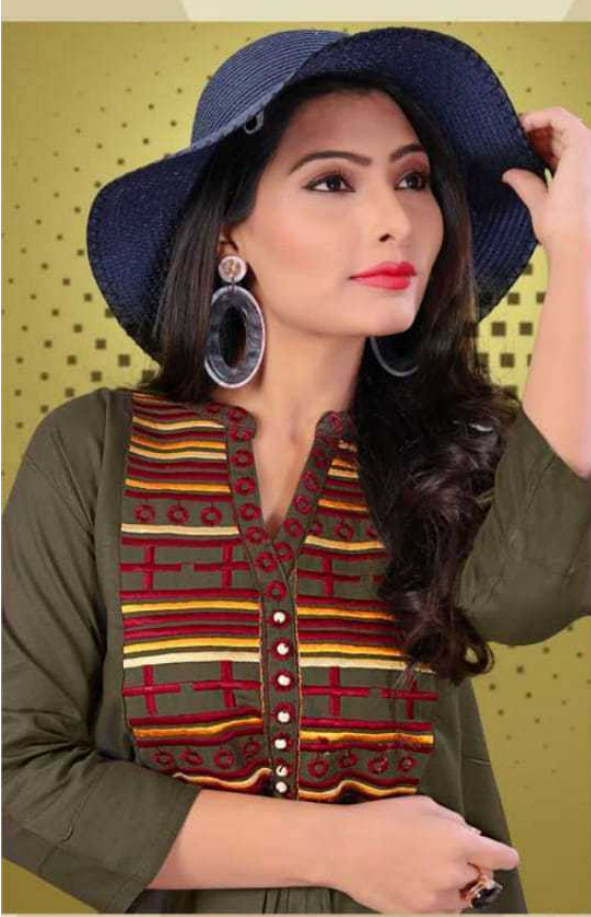
Variation of unique color palette the colors used from are of secondary color family.