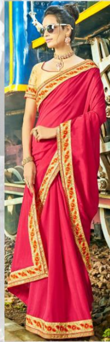
Design No. 63005