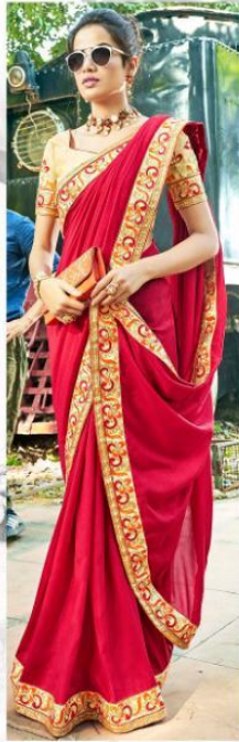
Design No. 63003