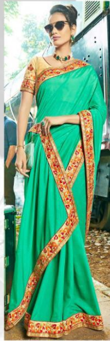
Design No. 63004