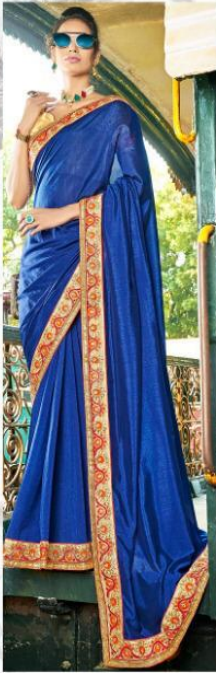
Design No. 63002