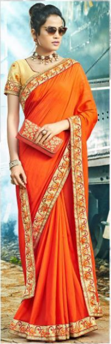
Design No. 63001