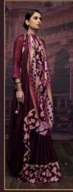
D. NO. - 1010