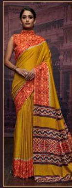
D. NO. - 1007