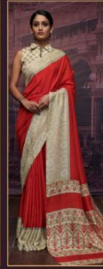
D. NO. - 1012