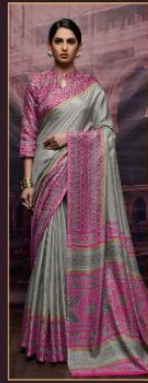
D. NO. - 1008