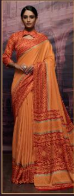
D. NO. - 1002