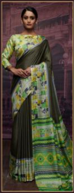
D. NO. - 1005