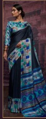
D. NO. - 1009