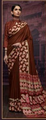
D. NO. - 1003