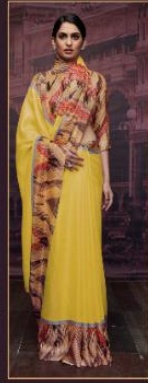
D. NO. - 1004