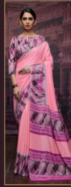
D. NO. - 1011