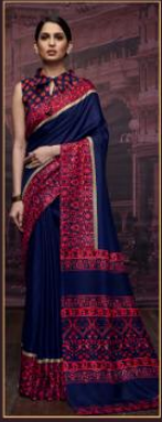
D. NO. - 1001