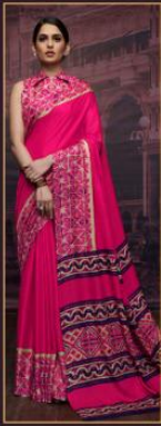
D. NO. - 1006