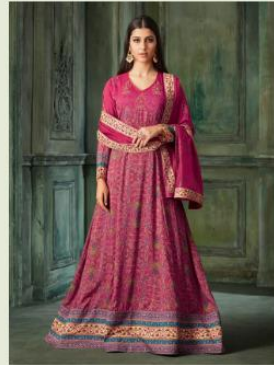
DESIGN NO. 106