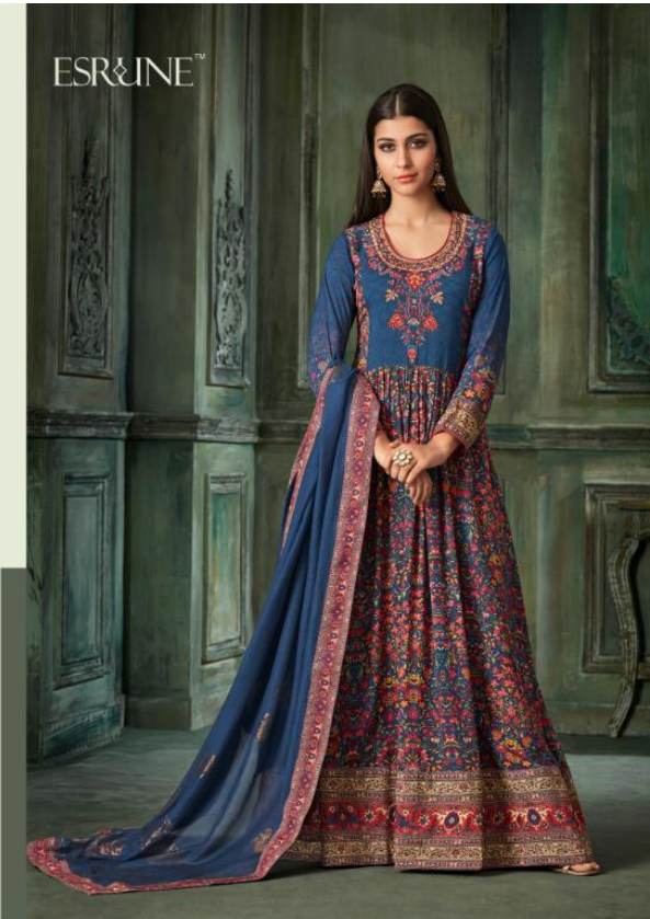
DESIGN NO. 104