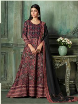
DESIGN NO. 101