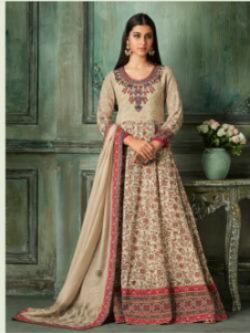
DESIGN NO. 105