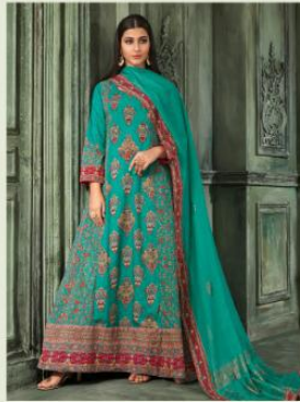
DESIGN NO. 102