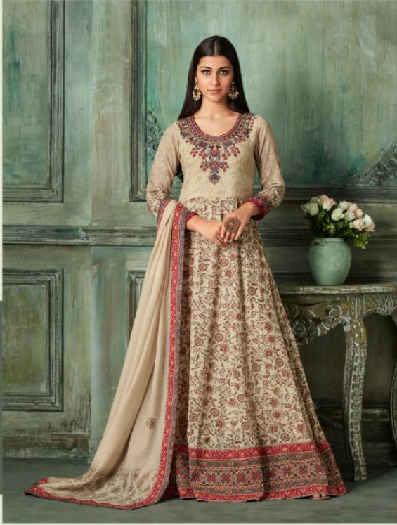
DESIGN NO. 105