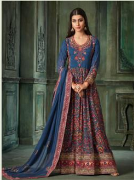
DESIGN NO. 104