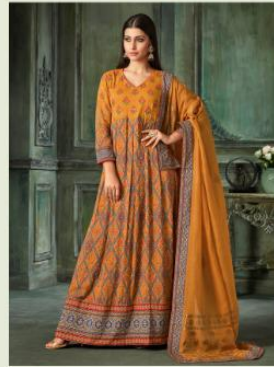
DESIGN NO. 103