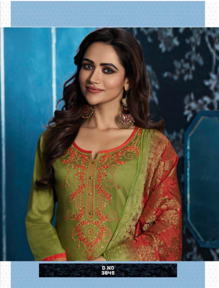
D. NO 3849