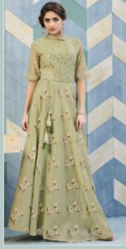
CODE NO :- 1172