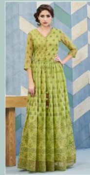
CODE NO :- 1178