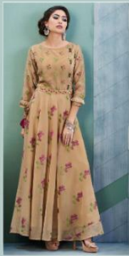
CODE NO :- 1173