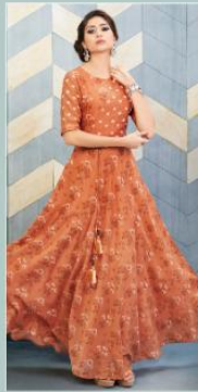
CODE NO :- 1174