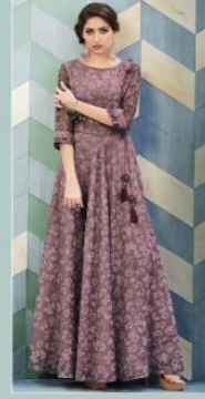
CODE NO :- 1176