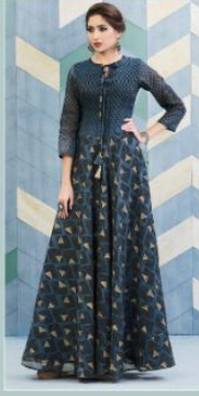
CODE NO :- 1171