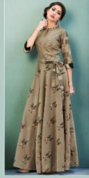
CODE NO :- 1175