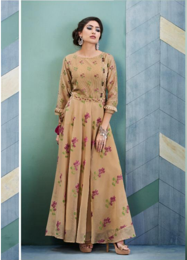
CODE NO :- 1173