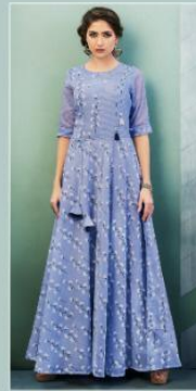
CODE NO :- 1177