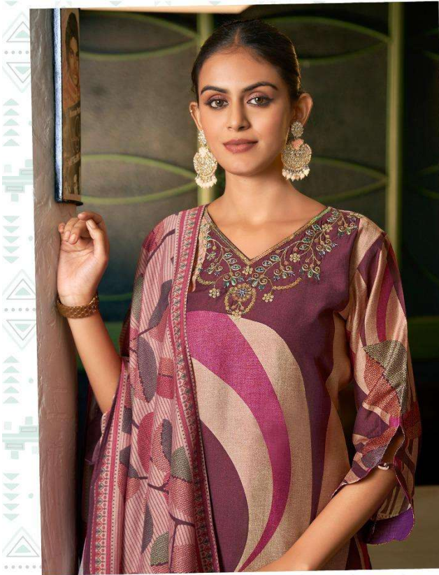
Indian Fashion Saree, Kurta and Kameez are all the way comfortable, yet elegant and easy to wear. Designer Kurta, Saree, Kameez and Chanderi are the latest trend in Indian fashion. Some are embellished with gorgeous embroidery work in pleasing designs. They manage to look smart enough to wear for casual family gatherings, or even for a wedding ceremony.