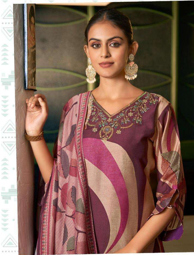
Indian Fashion Salwar Kameez and Kurta are all the way comfortable, yet elegant and easy to wear. Designer Kurta, Salwar Kameez and Charidar are the latest trend in Indian fashion. Some are embellished with gorgeous embroidery work in pleasing designs. They manage to look smart enough to wear for casual family gatherings, or even for a wedding ceremony.