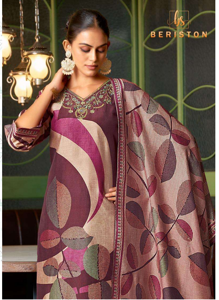
Indian Fashion Salwar Kameez and Kurta are all the way comfortable yet elegant and easy to wear. Designer Kurta, Salwar Kameez and Chanderi are the latest trend in Indian fashion. Some are embellished with gorgeous embroidery work in pleasing designs. They manage to look smart enough to wear for casual family gatherings, or even for a wedding ceremony.