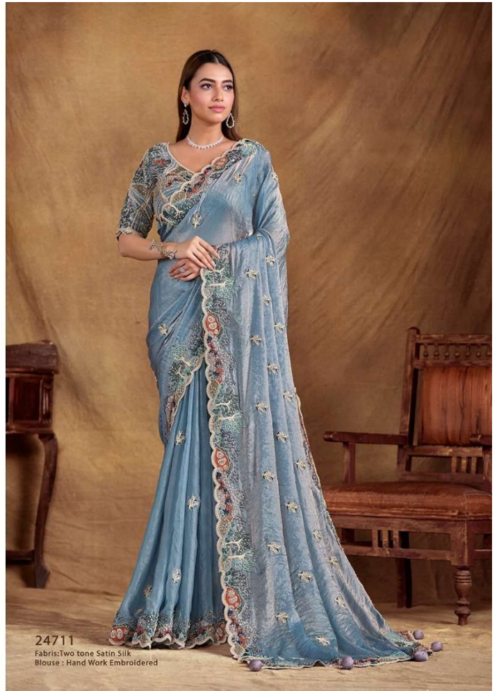
24711 Fabric: Two tone Satin Silk Blouse : Hand Work Embroidered