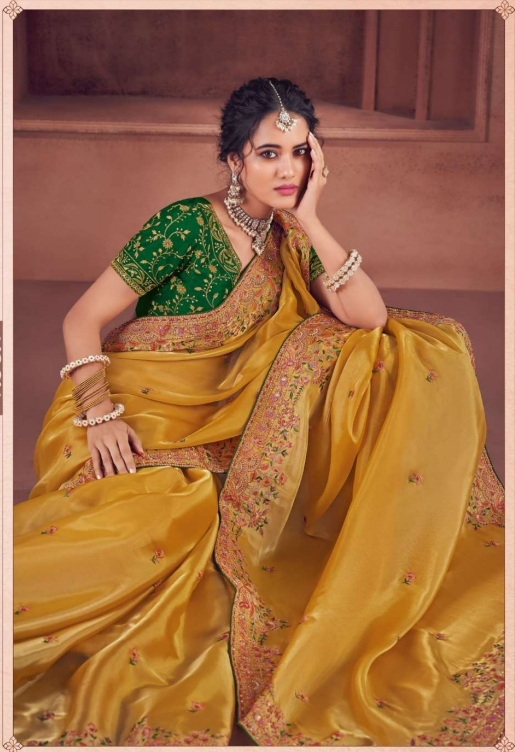
Contemporary design with refined detailing and exquisite quality maintaining streamlined shapes with fine fibres.