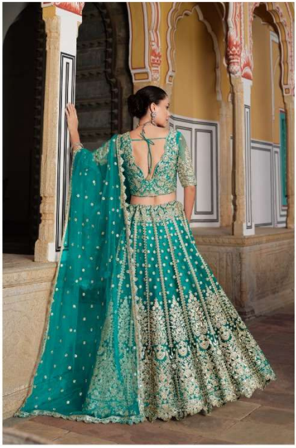
"Model is wearing a lehenga by Senhora. All rights reserved."