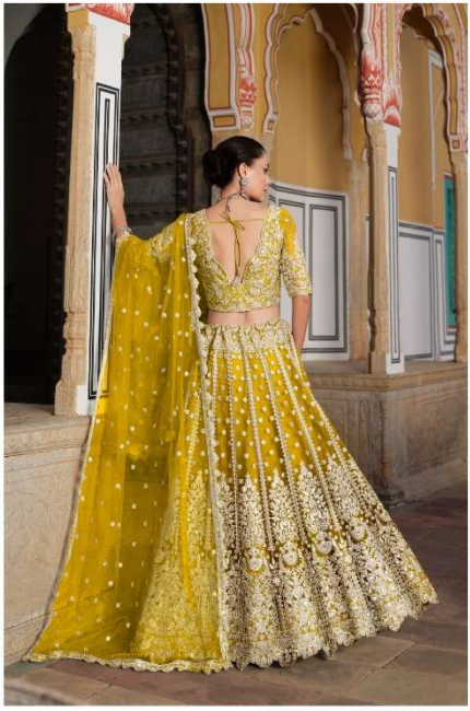
"Modeling in yellow with gold embroidery and a net for dupatta. Size: 4005 in 4005/4005/4005"