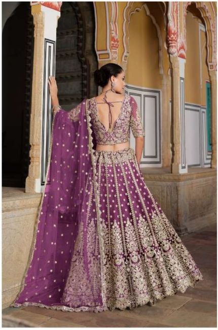
"Modeling in a traditional Indian style, the lehenga is a perfect blend of traditional and modern fashion." data-bbox="122 428 218 441"/>