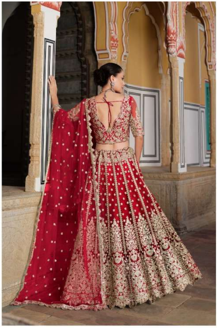
"Sinhora is a brand that offers the best of Indian fashion to the world. Our style is unique and elegant."