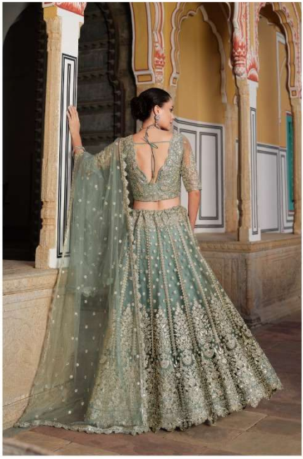
"Model is wearing a lehenga from the collection 'Senhora' - 2022. The lehenga is made of green and gold fabric with intricate embroidery." data-bbox="122 428 218 438"/>