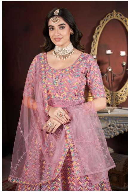
Rare, Eloquent and Alluring, a rich heritage of Indian craftsmanship and tradition unfolds in the new form of lehenga.