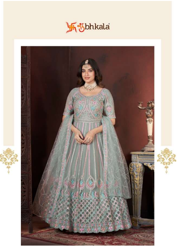
Rare, Eloquent and Alluring, a rich heritage of Indian craftsmanship and tradition unfolds in the new form of lehenga.