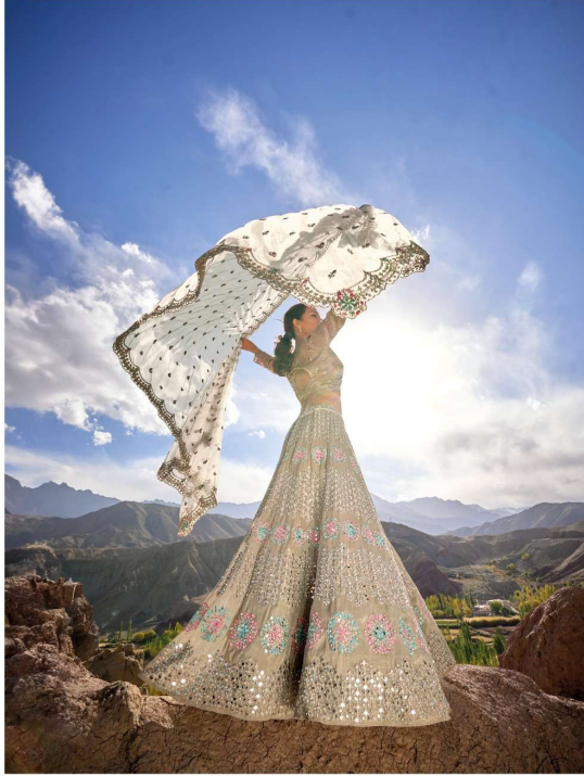
Women who have no one secure in their own strength will find clothes