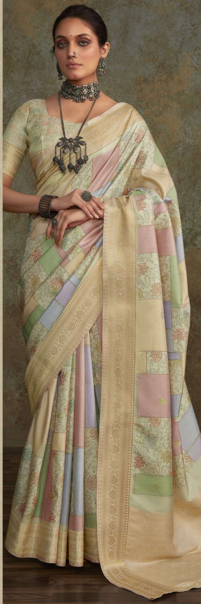
{ 350002 }