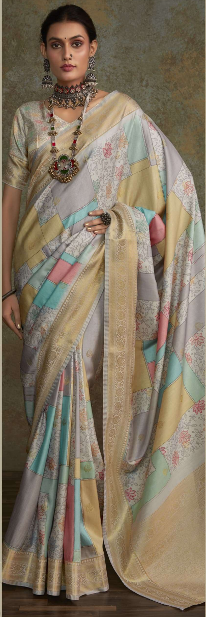
{ 350001 }