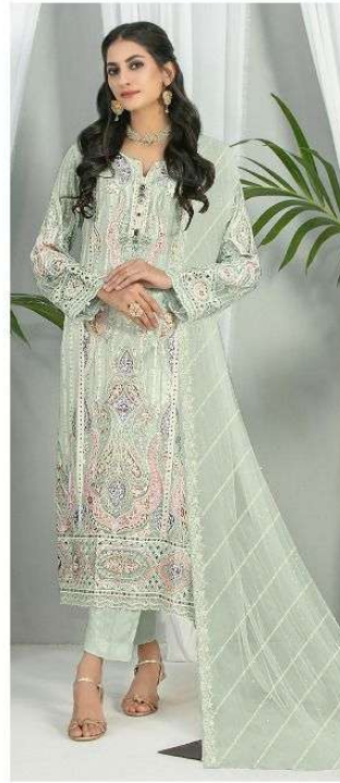
C -1351 E