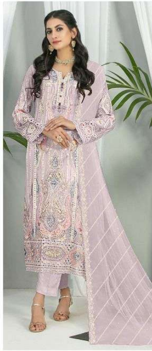
C -1351 D