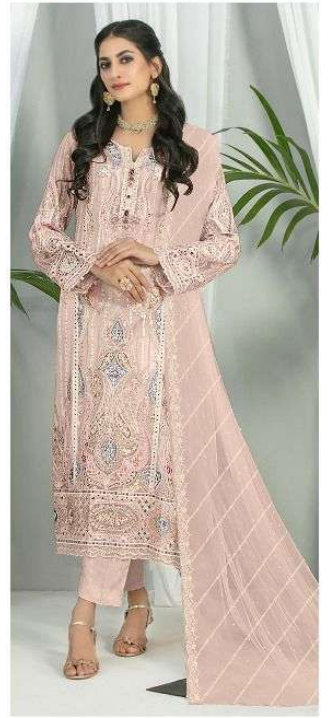
C -1351 F