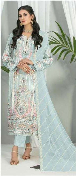
C -1351 C