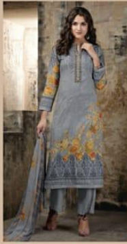
DESIGN NO #743