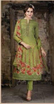
DESIGN NO #750