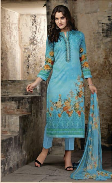
DESIGN NO. 740