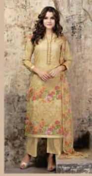
DESIGN NO #709