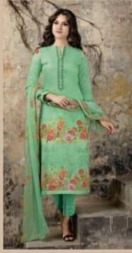
DESIGN NO #712