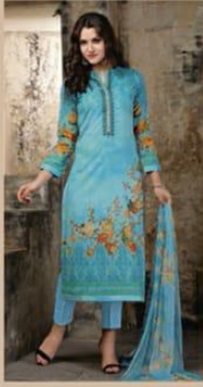
DESIGN NO #740