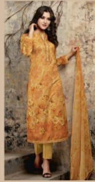
DESIGN NO #735