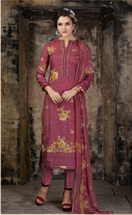
DESIGN NO. 722