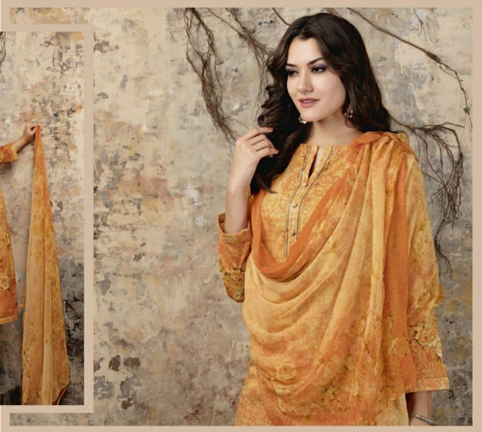
DESIGN NO. 735