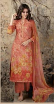
DESIGN NO #729