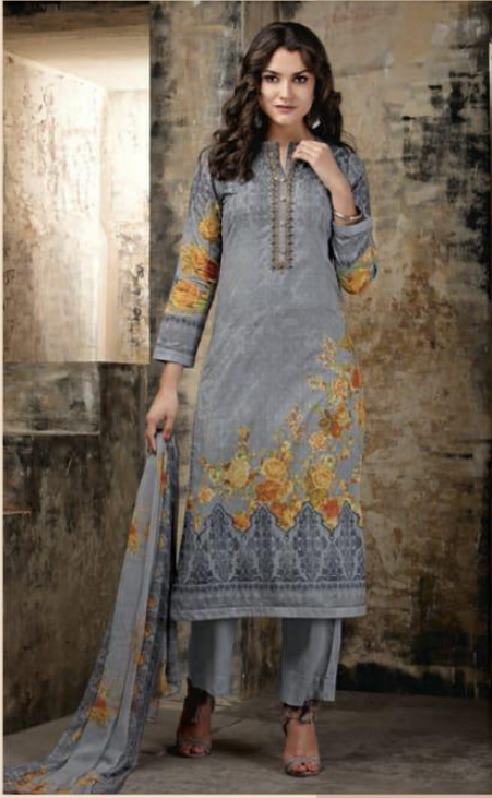
DESIGN NO. 743