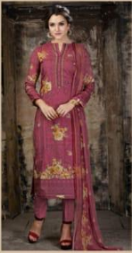
DESIGN NO #722