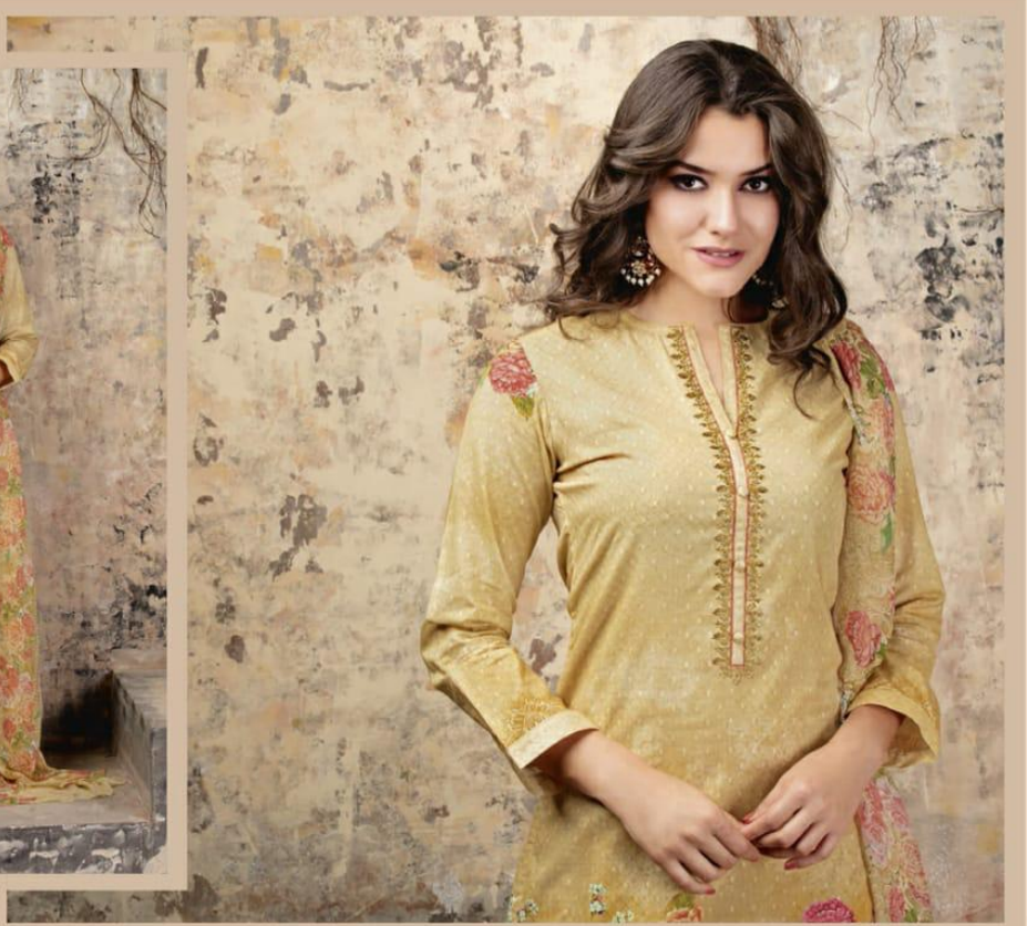
DESIGN NO. 709