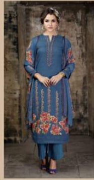
DESIGN NO #752