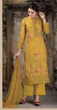
DESIGN NO #716