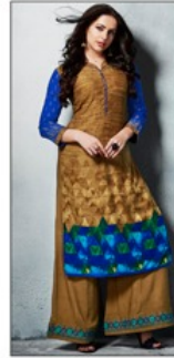
D.NO :- 800