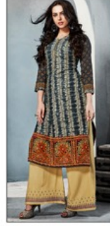
D.NO :- 797