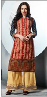
D.NO :- 794