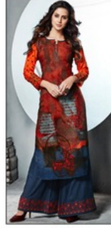
D.NO :- 796