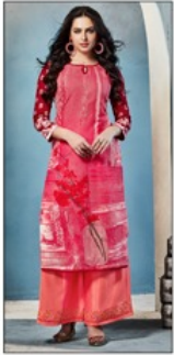
D.NO :- 793