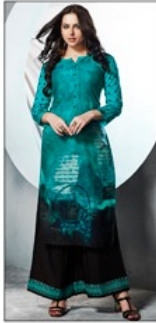
D.NO :- 795