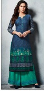
D.NO :- 792