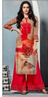
D.NO :- 801