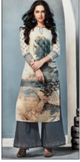
D.NO :- 790