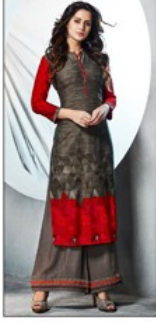
D.NO :- 791