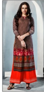
D.NO :- 799