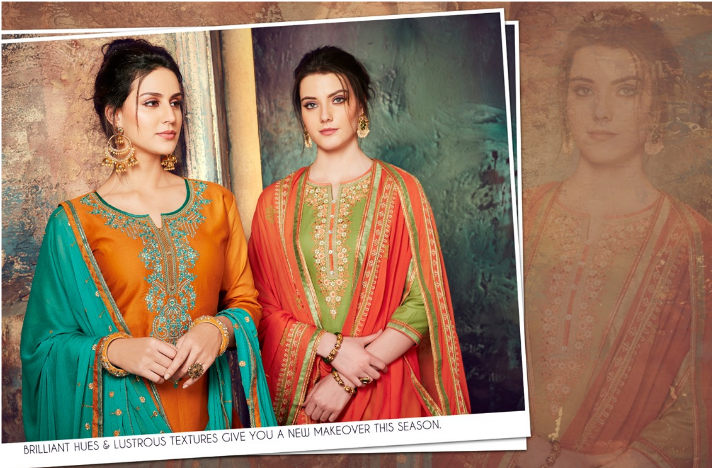
BRILLIANT HUES & LUSTROUS TEXTURES GIVE YOU A NEW MAKEOVER THIS SEASON.