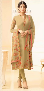
« D.NO.2703 »