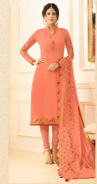
« D.NO.2706 »