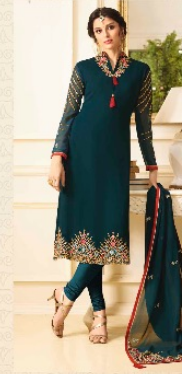
« D.NO.2705 »