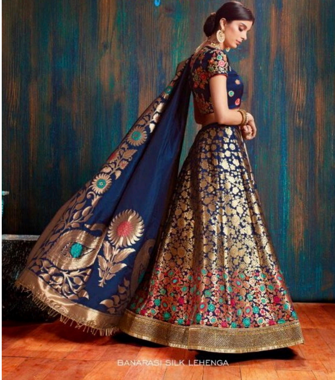
BANARASI SILK LEHENGA