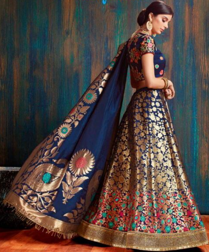
BANARASI SILK LEHENGA