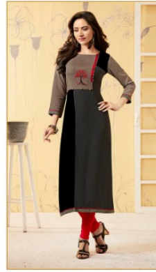
●●●● D.NO-1223 ●●●●