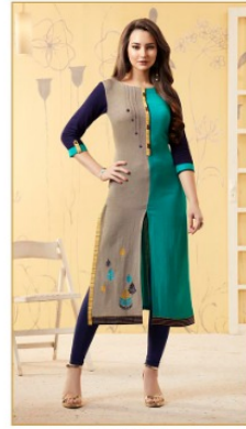
●●●● D.NO-1224 ●●●●