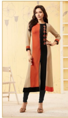
●●●● D.NO-1226 ●●●●