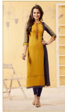
●●●● D.NO-1227 ●●●●