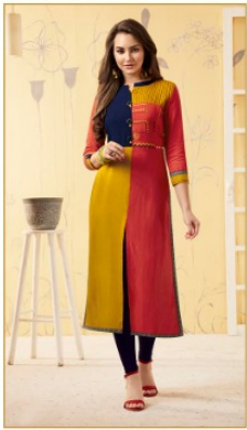
●●●● D.NO-1225 ●●●●