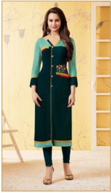
●●●● D.NO-1221 ●●●●