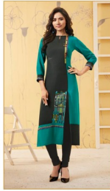
●●●● D.NO-1222 ●●●●