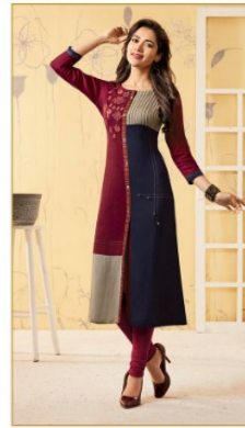
●●●● D.NO-1228 ●●●●