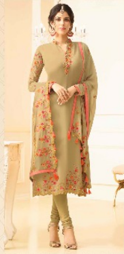
« D.NO.2703 »