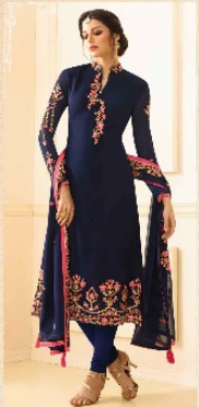
« D.NO.2707 »