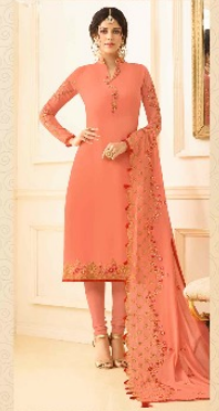
« D.NO.2706 »