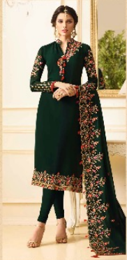
« D.NO.2701 »