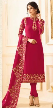
« D.NO.2704 »