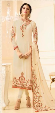
« D.NO.2708 »