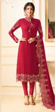
« D.NO.2702 »