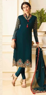
« D.NO.2705 »