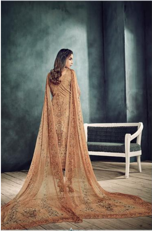
Let your dress complement your trend and personality... D.NO:- 700