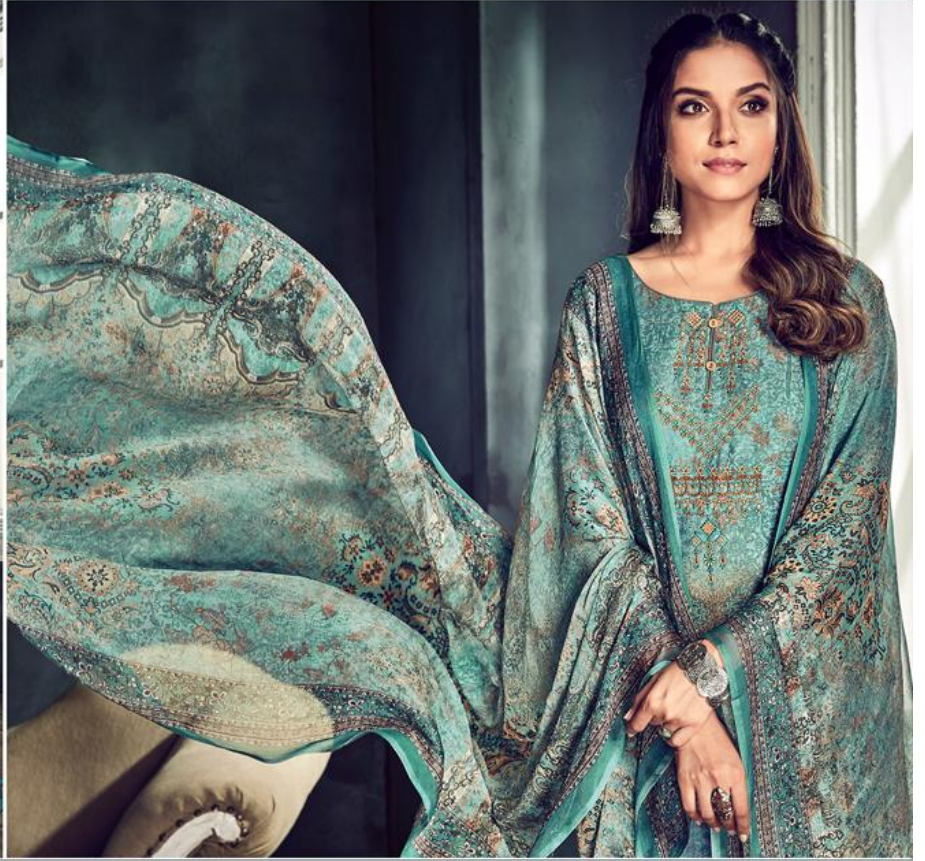
Blasting bright colour is one of the most favourite fashion trends... D.NO: 693