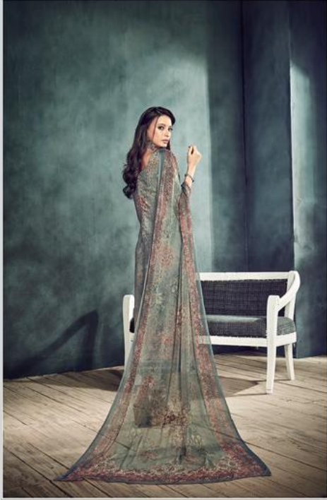
This sparkling beauty of garment will work their magic on everything in your wardrobe... D.NO- 695