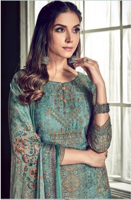
Extremely beautiful fashion piece of ethnic wear designed keeping grandeur in mind... D.NO- 693