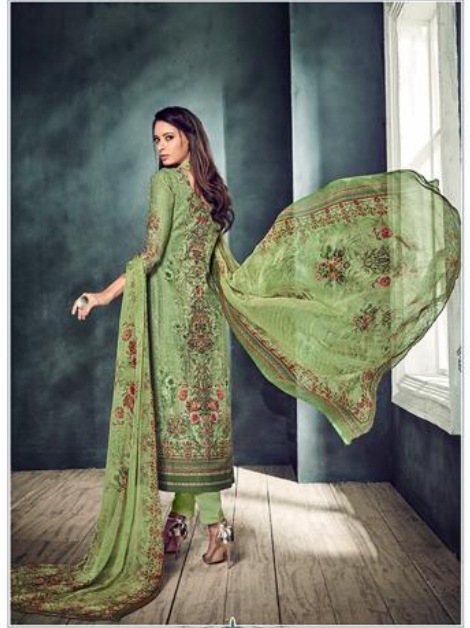
This collection bring you an unmatched luxury in brilliant tone with a wide range of embroidered fabrics D.NO- 697