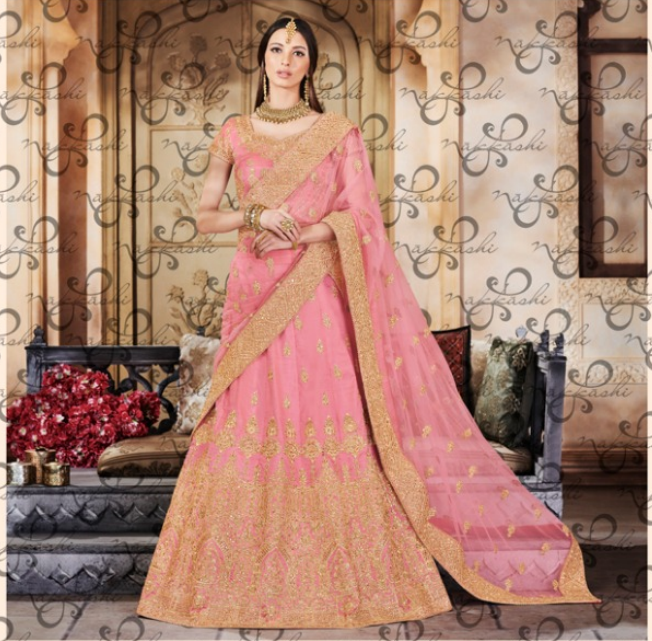
Peach belongs in Handloom fabric with Jari working. Blouse in matching fabric and pallu in matching mono net fabric.