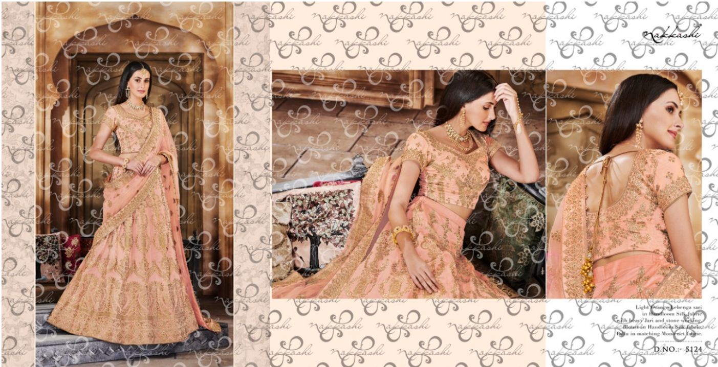
Light Orange lehenga sari in Handloom Silk fabric with Jari and stone work Blouse in Handloom Silk fabric Dala in matching Monnet fabric. D.NO:- 5124